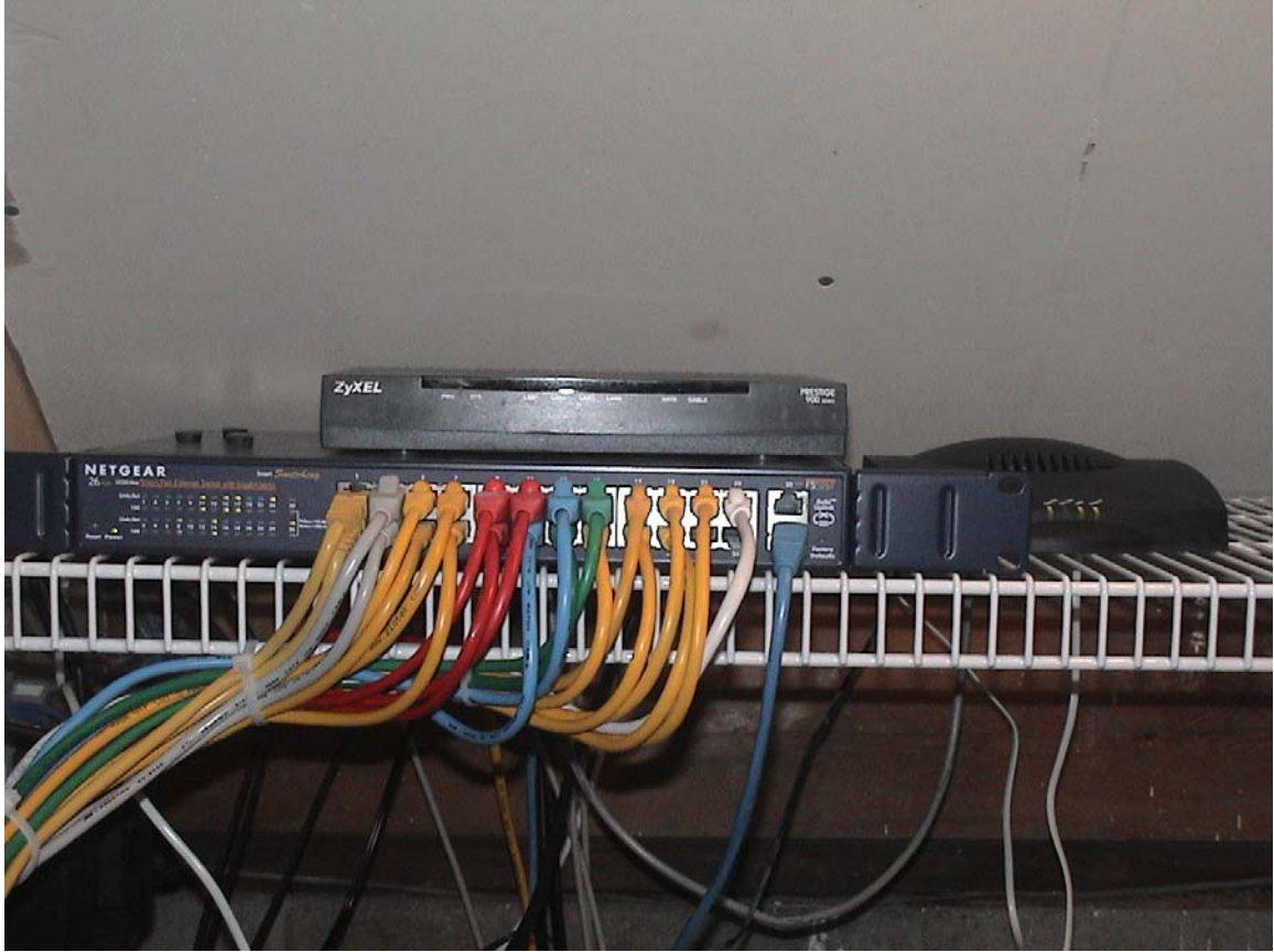
Our Netgear 24-port Ethernet switch (with 2-gigabit ports) is shown here plus our cable modem and Lingo modem which provides voice over IP (VoIP) for our home phone line.